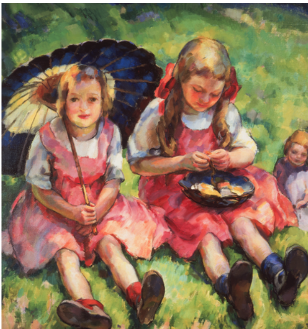
Edouard Vysekál, The Sisters , 1922, Oil on canvas, 36 1/8 x 34 1/8 x 2 1/8 in., UC Irvine Jack and Shanaz Langson Institute and Museum of California Art. Gift of The Irvine Museum

Location: Self drive to UC Irvine Jack & Shanaz Langson Institute & Museum of California Art, 18881 Von Karman Avenue. Parking is free with validation.